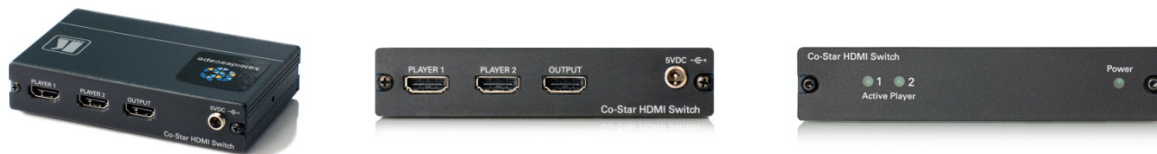
The Kaleidescape Co-Star HDMI switch.

Strato receives and manages all control commands for the paired players. Control system programming is not necessary during installation. Simply re-assign the Premiere M-Class player's IP to the new Strato player.