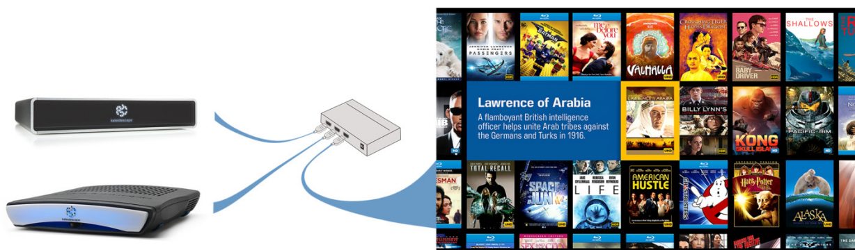
A Strato C player paired with an M300 player using Kaleidescape Co-Star, displaying Blu-ray, DVD, 4K HDR, UHD, HD, and SD titles.

Strato systems can store and play digital movies in 4K HDR, UHD, HD, and SD from the Kaleidescape Movie Store. Premiere systems can store and play DVDs, Blu-ray discs, and digital movies in HD or SD from the Kaleidescape Movie Store. Kaleidescape Co-Star allows a Strato player and an M-Class player to act together as a single video source to seamlessly playback DVDs, Blu-ray discs, and all digital movies up to 4K HDR.