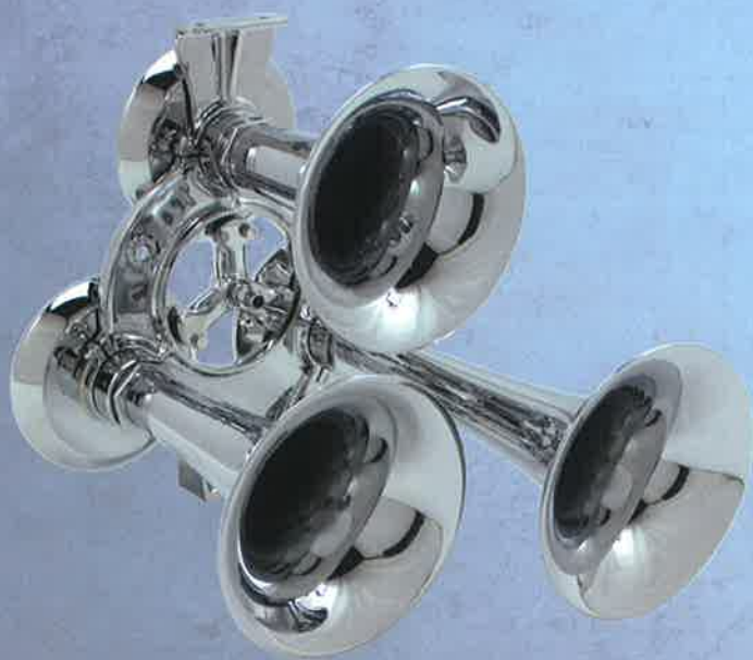
T-3A Air Horn