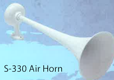
S-330 Air Horn