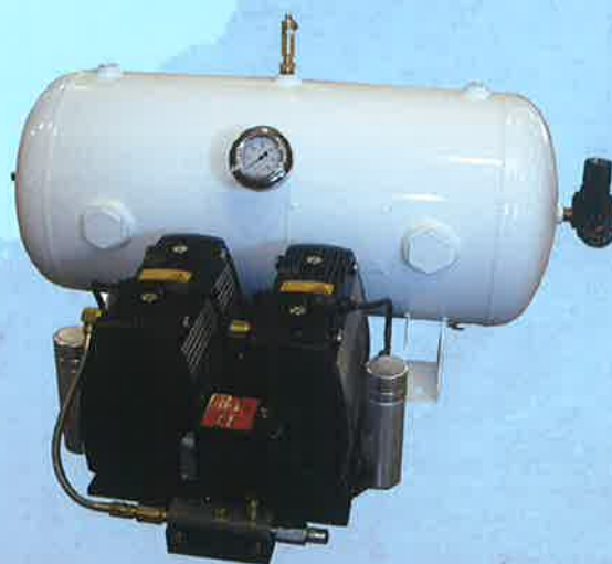
KA-1000 Air Compressor System