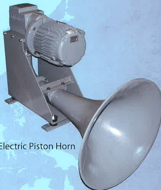
KPH-130 Electric Piston Horn