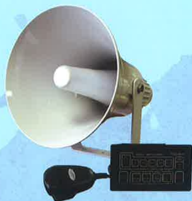
KB-30 Electronic Horn/Hailer