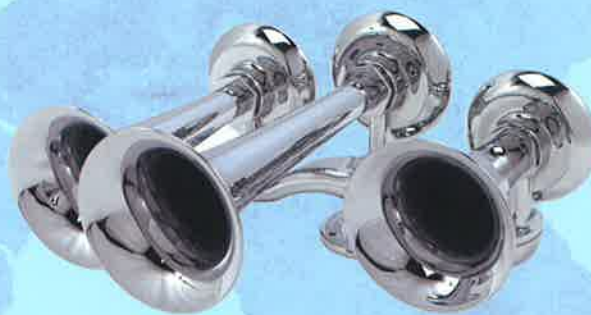
T-2 Air Horn