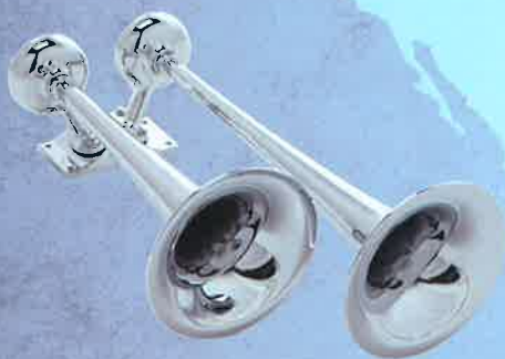
D-0A Air Horn