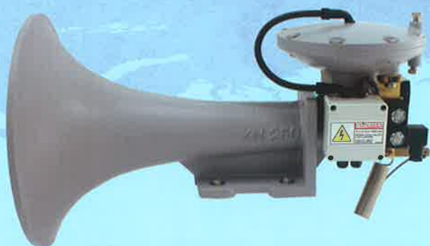
KM-200-DVM-H Heated Air Horn

Kahlenberg air horns and electric horns are developed to withstand the extreme demands of commercial and military service. The durability of Kahlenberg sound signals has been proven over decades of service on ocean-going vessels; an important element in protecting any type of vessel and her crew.